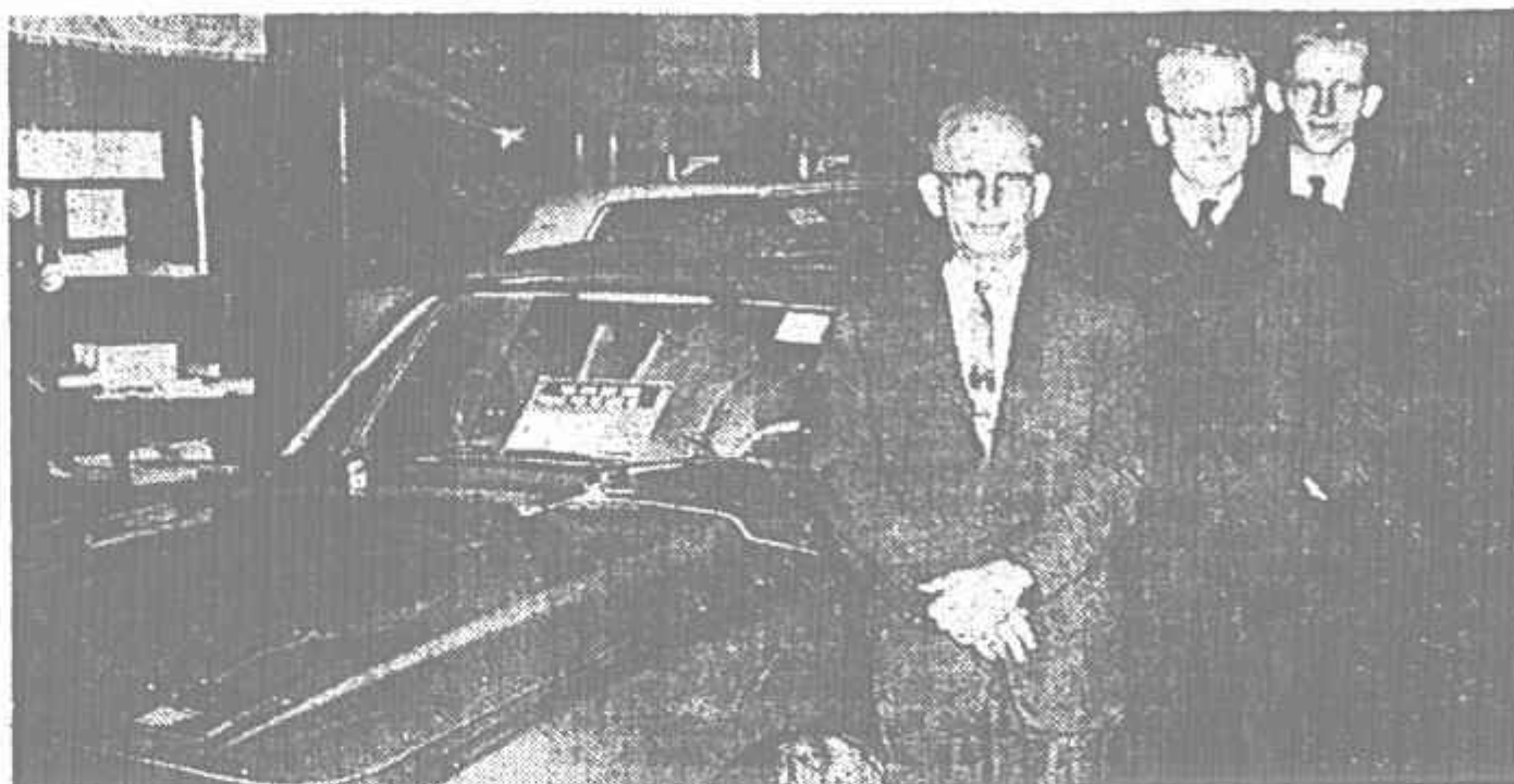
FRANK D. ROBINSON, INC. HAS KNOW-HOW —A family-owned corporation, Frank D. Robinson, Inc., at 83-93 Hawley Street, has kept apace of cars and the automotive field in Binghamton since 1913.

One of the most important parts of any automobile agency is the parts and service departments. The parts department at Frank D. Robinson, Inc. stocks over $20,000 in parts for DKW, Mercedes-Benz, Packard and Studebaker automobiles.